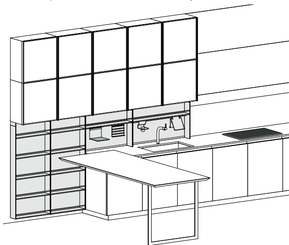
"Space" elemento colonna sospesa